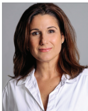
Stephanie J. Block Into The Woods, The Cher Show